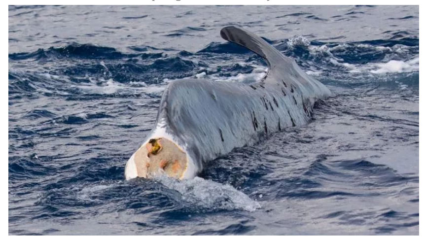
Figure 1 - The whale without the tail

The risks of collisions between hips and whales is not negligible and also the Pelagos Sanctuary the presence of commercial ports and heavy marine traffic is not a fully safe environment for the Cetaceans! Only two months ago it has been reported the sighting of a whale without the tale, cut by a propeller (https://www.ilsecoloxix.it/savona/2020/06/22/news/codamozza-il-viaggio-della-balena-con-la-coda-amputata-da-messina-al-santuario-pelagos-1.38998013).