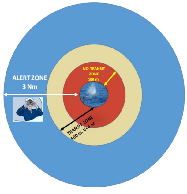
Figure 2 – The three areas defined by the Protocol of Conduct

The levels yellow and orange are automatically determined by the system, while the setting of the red alert is decided by the VTS personnel of the Savona Coast Guard